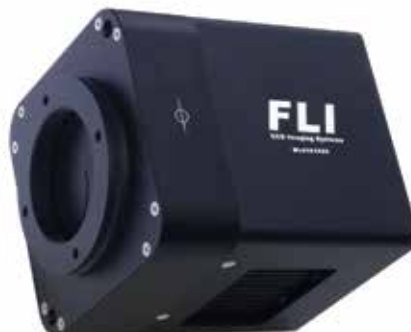
Light and Compact