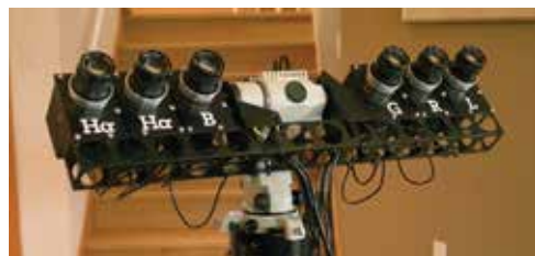
We specialize in unique solutions.