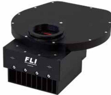
ProLine Camera with CFW-4-5 Filter Wheel

FLI's color filter wheels' robust mechanical designs provides the basis for stunning, uncompromising images. Each FLI color filter wheel is precision engineered with a highly accurate no-slip drive chain and stepper motor. The large diameter pivot pin and bushings are precision ground and matched for smooth, quiet no-fuss operation night after night. FLI color filter wheels do not use internal lights for homing, so your images are protected from stray light interference.